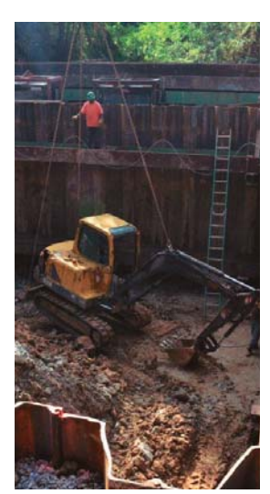
Central Consolidated Pump Stations (2,3,4,5,6,7,10,91 and Southdowns) Project