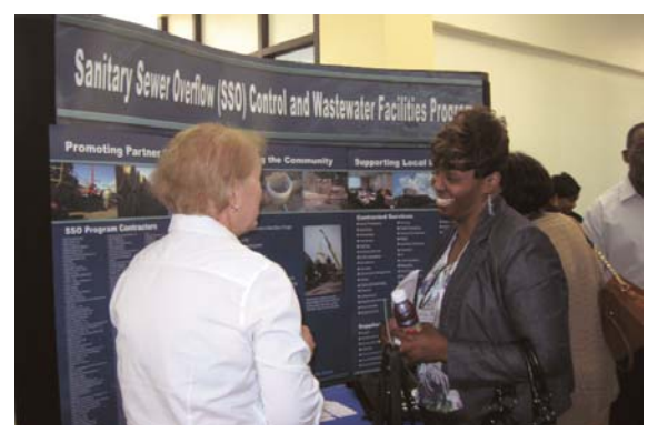
SSO Program staff participated in events promoting small business participation in April and June.

The Sanitary Sewer Overflow (SSO) Program is improving the City of Baton Rouge/East Baton Rouge Parish's wastewater infrastructure, contributing to meeting important Consent Decree requirements, and preparing a solid foundation for future growth in the Parish. During the second quarter of 2012, construction on