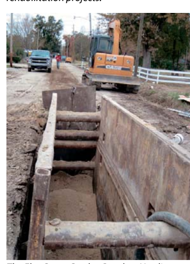
The Elm Grove Garden Road to Harding Boulevard rehabilitation project involved the removal and replacement of sewer pipeline and manholes.