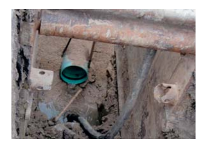
SSO Program and Green Light Plan staff coordinate sewer pipeline and road rehabilitation projects.