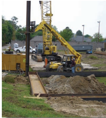
Capacity improvements include the installation of new pump stations and wet wells throughout the Parish.

The East Baton Rouge Parish sewer system was originally built in the late 1800s. In 1958, a Consolidated Sewer District comprising more than 400 pump stations and a network of pipelines was developed, and three wastewater treatment plants (WWTPs) were built to treat used water and sewage from homes, industry, businesses, and schools so that it can be returned safely back into the environment. Growth in the 1970s and 1980s resulted in the addition of individual (subdivision) treatment plants, and a federal mandate in 1984 required the upgrade of the North and South WWTPs and subdivision package plants.