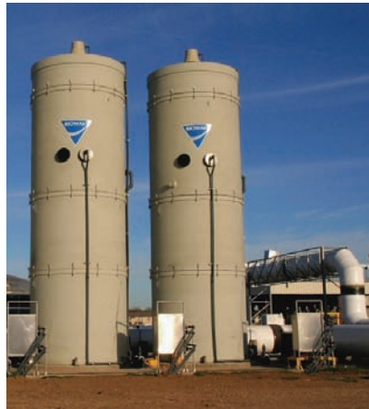
Two biotower units are being installed at the North WWTP as parts of the Headworks Odor Control Project.

Six projects at North and South WWTPs will accommodate wet weather flows with a combination of process improvements and storage facilities and bring the South WWTP into EPA compliance with process improvements