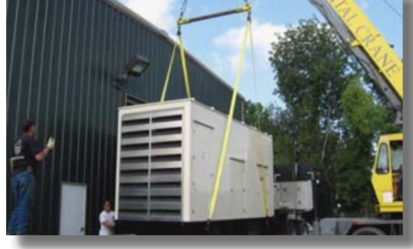
Removing a 600kw generator off shipping truck to be stored at the warehouse until time for installation.

To address this issue, the Parish will install emergency generators at the South WWTP and the North WWTP, and all the pump stations in the collection system as part of this program. Emergency generators, including the equipment purchase and installation costs are estimated to cost $36M.