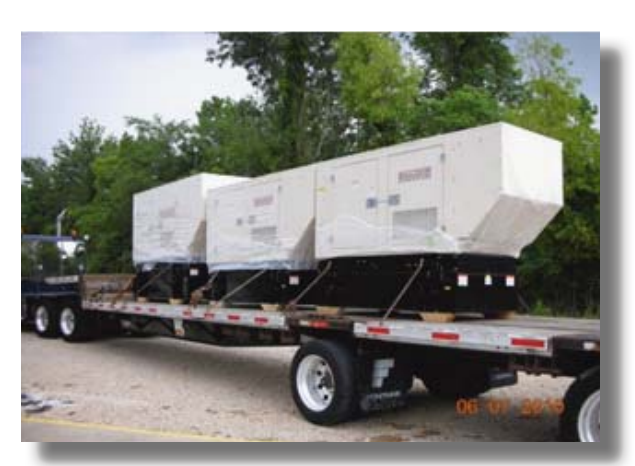
Three generators being transported to the warehouse for temporary storage.

To date, we have received a total of 28 generators which are being stored by DPW until installation. The advertisement for the Installation Contract will be advertised on June 18, 2010