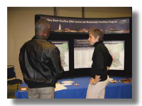
Collaborative efforts with the SSO Program and small, minority and disadvantaged businesses are being discussed at the Minority Business Workshop.