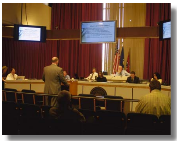
A Managing Change in Construction workshop was held with City-Parish Metro Council members March 10<sup>th</sup>.

On March 10, 2010, the SSO Program Management Team delivered a workshop titled Managing Change in Construction to provide Metro Council members with information as to what types of change occur during construction and what to expect with regard to the SSO Program.