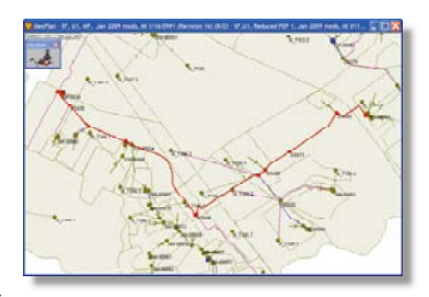
The figure is an example of a computerized model network.

computerized model of the City of Baton Rouge/East Baton Rouge Parish sewer system. The calibrated model was run using the storm event outlined in the Consent Decree, and sanitary sewer overflows (SSOs) at both existing and future peak wet weather flows were determined from the model runs. If an SSO occurred in both the model and in the real world, capacity in either the nearby pipelines, pump stations, or both was increased so that the SSO would no longer occur in the model.