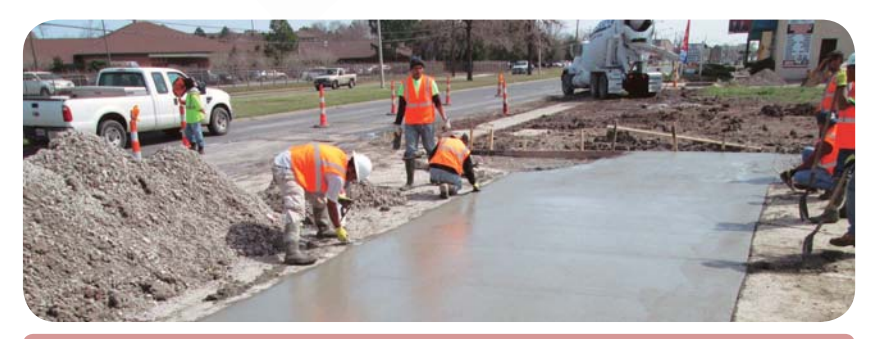
Road restoration includes laying concrete, as exampled in the picture above

The construction and rehabilitation of the Baton Rouge sewer system is critical to bringing the City of Baton Rouge/East Baton Rouge Parish (City/Parish) into compliance with the Consent Decree, which was federally mandated to reduce sanitary sewer overflows (SSOs) and to come into compliance with wastewater treatment plant discharge limits.