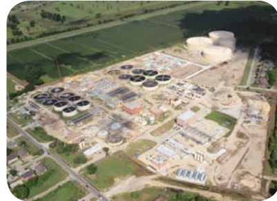
An aerial of the SWWTP.

Mayor-President Melvin L. "Kip" Holden, City-Parish Department of Public Works, and the SSO Program hosted a tour of the South Wastewater Treatment Plant (SWWTP) during the largest water quality conference and exhibition in the world, WEFTEC 2014 – New Orleans, LA, "Where the Greatest Minds in Water Meet."