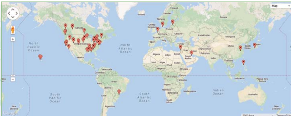
SWWTP tour attendees came from all over the world.

The tour was supported by program manager CH2M HILL, construction contractor Brasfield & Gorrie and the host of engineers and equipment manufacturers who were involved in the projects.