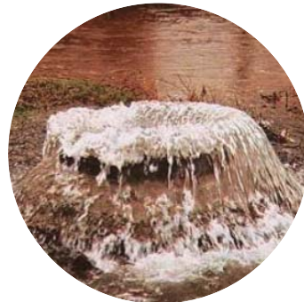
An example of an SSO.

These projects will upgrade and rehabilitate the system by increasing the system's capacity and fixing defects so that it can effectively serve the parish's 445,000+ residents. Once all projects are complete, the wastewater system will have nearly 2,000 miles of separate gravity and pressure sewer systems and more than 400 pump stations.