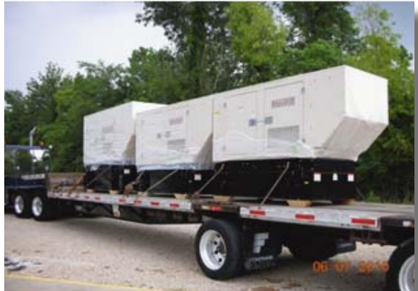
Three generators being transported to the warehouse for temporary storage.