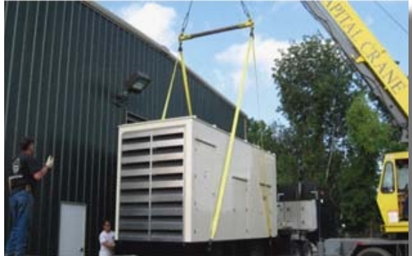
Removing a 600kw generator off shipping truck to be stored at the warehouse until time for installation.